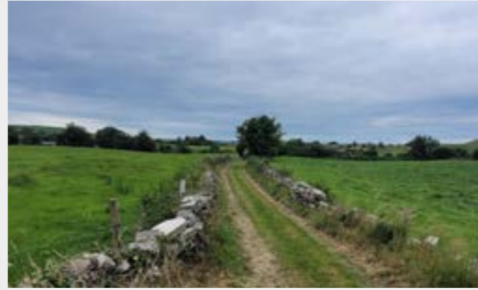
Figure 1: Study Area